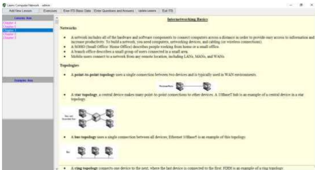
Figure 3: Student lessons and examples form.