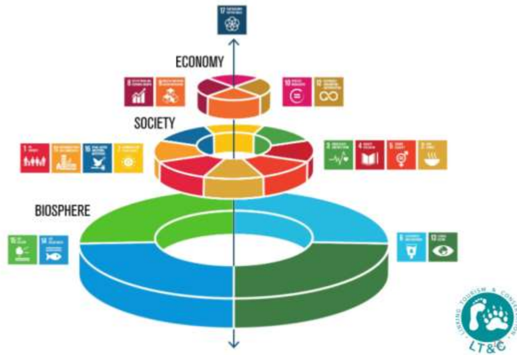
1-figure. Achieving national sustainable goals 1

the regional economy while aligning with broader national objectives. This article examines the multifaceted nature of sustainable development in the Uzbek context, emphasizing the need for inclusive growth, economic stability, social equity, and environmental preservation. It also addresses the prevailing regional disparities and underscores the importance of tailored policies and targeted investments to promote balanced regional development.