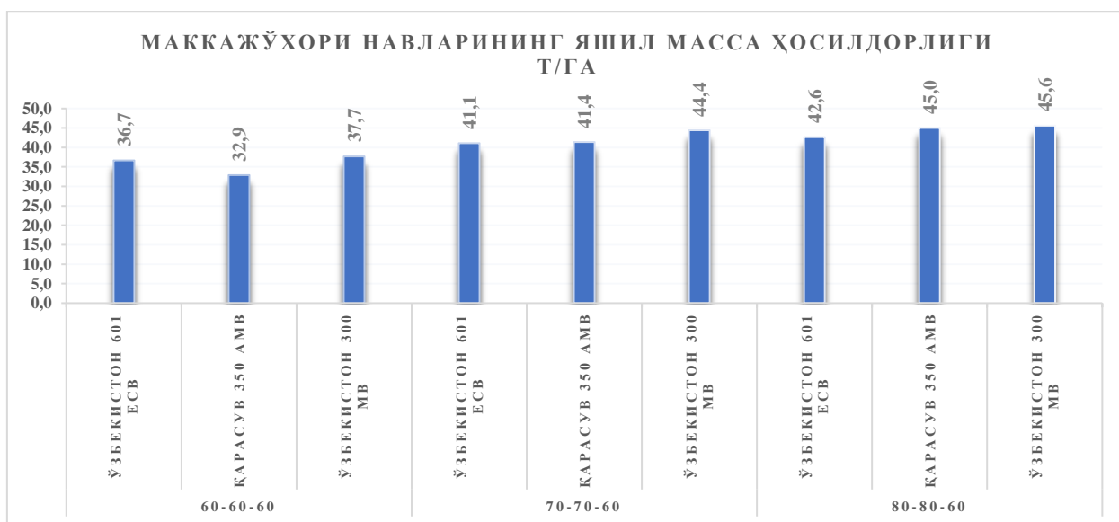
Figure 1. Effect of irrigation regime on green mass yield of corn varieties planted as main crop in c/ha.

Among Uzbekistan-601 ESV, Karasuv-350 AMV and Uzbekistan-300 MV varieties irrigated in the order of irrigation 80-80-60% with pre-irrigation soil moisture relative to field capacity, on average, 42.6; 45.0 and 45.6 t/ha of green mass was obtained in three years, respectively and it was noted that the highest green mass was obtained in relation to lower irrigation methods.