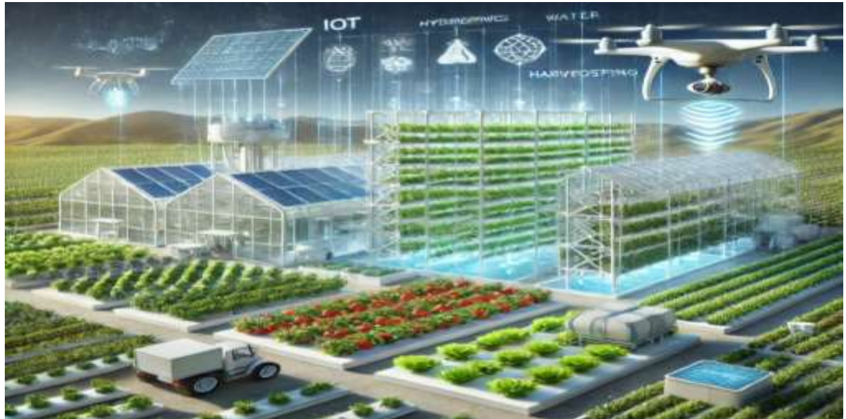
Fig-1. 3D visualization illustrating the integration of modern technologies in fruit and vegetable cultivation

3D visualization illustrating the integration of modern technologies in fruit and vegetable cultivation. It features innovative systems such as vertical farming, hydroponics, IoT sensors, and automated robotics, all within a sustainable framework.