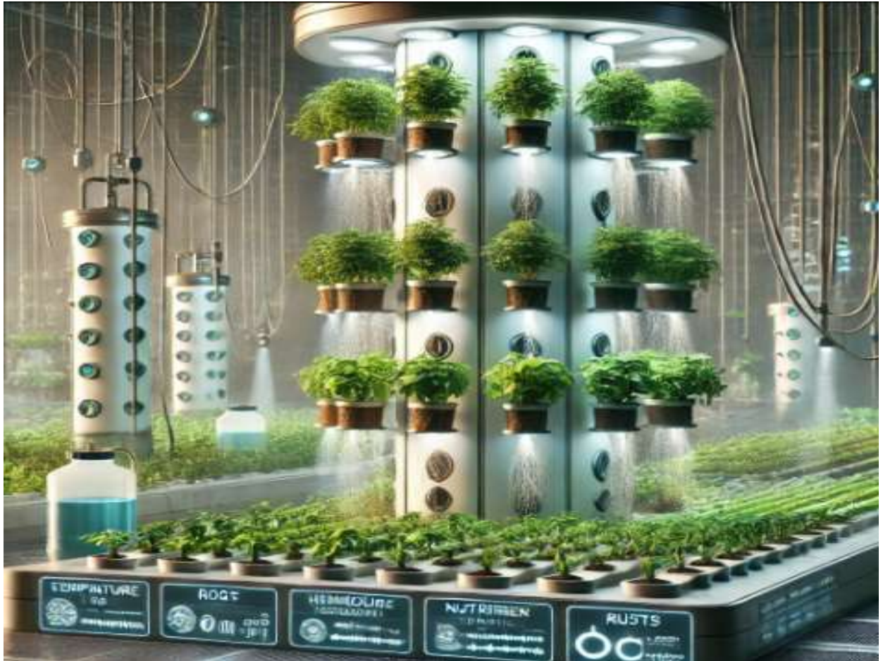
Fig-1. 3D illustration of the aeroponic method of nutrition

3. Higher Yields: Due to the optimized growing conditions and faster growth rates, aeroponic systems often yield higher crop outputs. Plants are provided with nutrients in a highly efficient manner, which leads to better overall health and productivity.