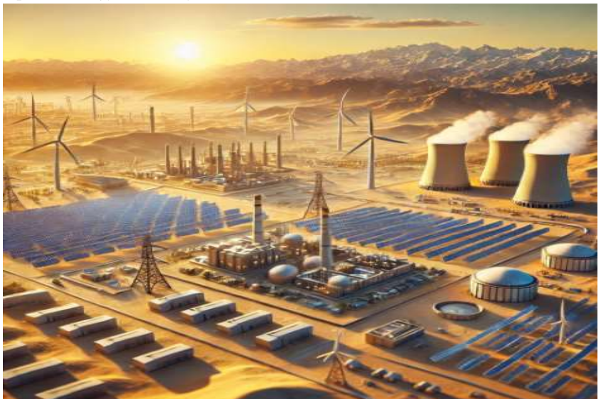
Fig-1. 3D illustration depicting energy prospects in Uzbekistan.

Uzbekistan faces challenges in energy efficiency, as the country's energy sector is historically characterized by high levels of waste. To address this, significant investments are being made in modernizing energy infrastructure, improving transmission networks, and encouraging the adoption of energy-efficient technologies. The government has set targets to reduce energy intensity and improve energy efficiency in both industrial and residential sectors.