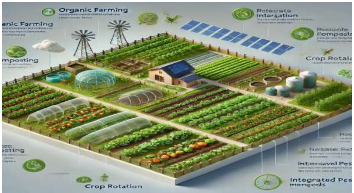
Fig-1. 3D illustration showing the boundaries and layout of an eco-friendly farm for growing fruits and vegetables.

Here is a 3D illustration showing the boundaries and layout of an eco-friendly farm for growing fruits and vegetables. It includes defined zones for organic farming, composting, crop rotation, and integrated pest management, along with features such as drip irrigation systems and renewable energy sources. The scene highlights how different eco-friendly techniques work together in a sustainable farming environment.